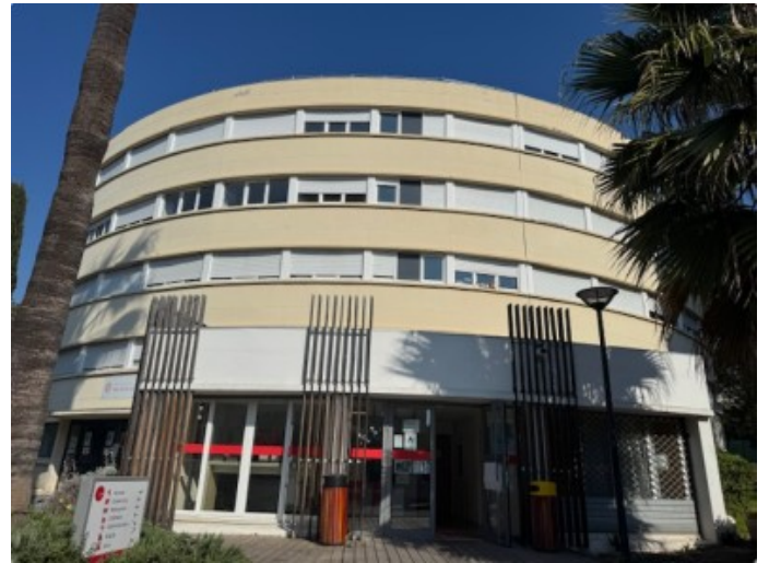
Entrance of the residence Montebello (accueil)