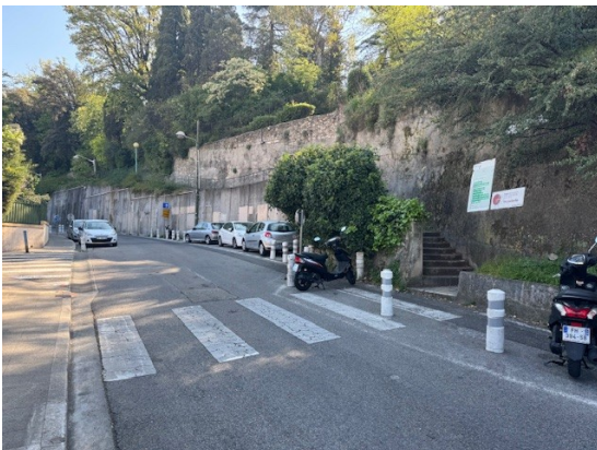
79 Avenue Valrose