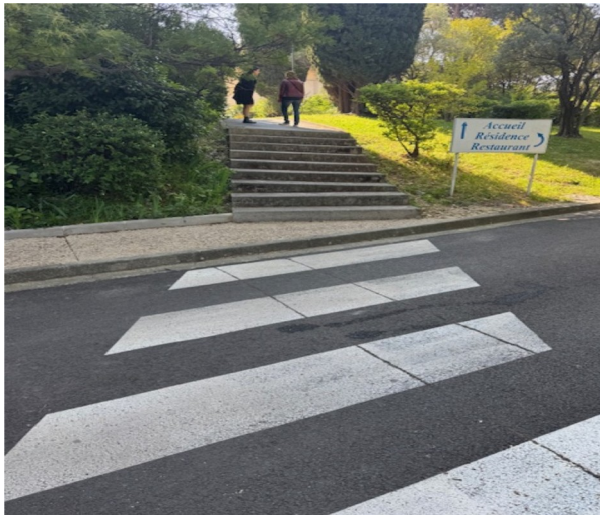
On the way to the residence Montebello.