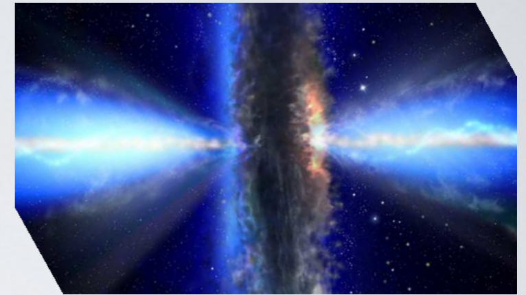
Production and acceleration mechanisms