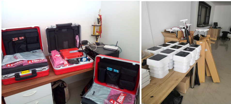
Figure 2. CAEN educational kits for the interconnected laboratories, shipped and arrived to Colombia, Ecuador, Peru (left). Meteorological data analysis stations for Citizen Science Projects ready to be shipped to Colombia, Ecuador, Peru and Venezuela by February 2022 (right )

As already mentioned, all this equipment is intended to be operated both locally and remotely and will, for this, be immersed in a Virtual Reality environment framework: the Virtual LA-CoNGA physics LAB currently in development.