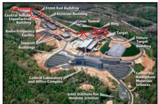
Compared to the conventional short pulse spallation sources, here SNS, Oak Ridge, USA, the Long Pulse concept of ESS offers a simplified accelerator system: H^+ linear accelerator without accumulator ring reduces technical challenges (injection, space charge, target fatigue) and offers superior neutron beam performance by more neutrons /pulse.

Simplified accelerator and target system : - only linear accelerator is needed - higher neutron beam performance at comparable costs and technical challenges - 5 MW (and more) proton beam power feasible