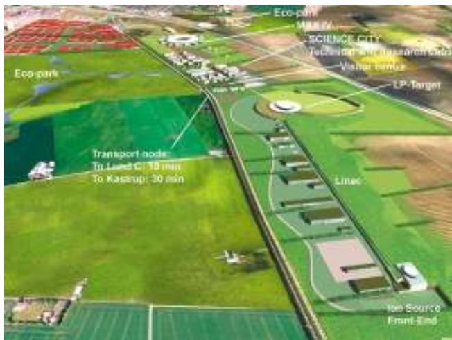
Artists conception of ESS on a green field site outside the university town Lund. It will consist of a linear proton accelerator, a target station as the neutron beam source and a host of neutron scattering instruments at 15 – 100 m distance from the target.

ESS is the next generation European neutron source, to be built at Lund in Sweden. It entered its pre-construction phase as a Collaboration of by now 14 countries: Denmark, Estonia, France, Germany, Hungary, Iceland, Italy, Latvia, Lithuania, Norway, Poland, Spain, Sweden and Switzerland.