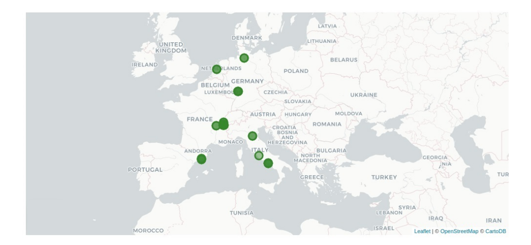
Figure 1. The RSEs distribution of the Pilot Data Lake from ESCAPE monitoring.

storage solution is also used in federated and geographically-distributed data centres under a unique storage namespace for specific ESCAPE institutes, offering a single user entry point.