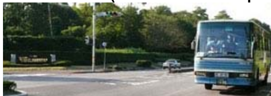
Highway Bus "Mt. Tsukuba Line" was discontinued on Sep.30